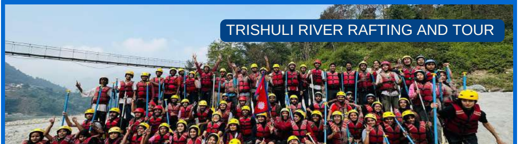
TRISHULI RIVER RAFTING AND TOUR