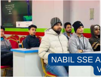
NABIL SSE AND INDUSTRIAL VISIT