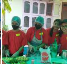
SEMINARS AND FOOD FEST