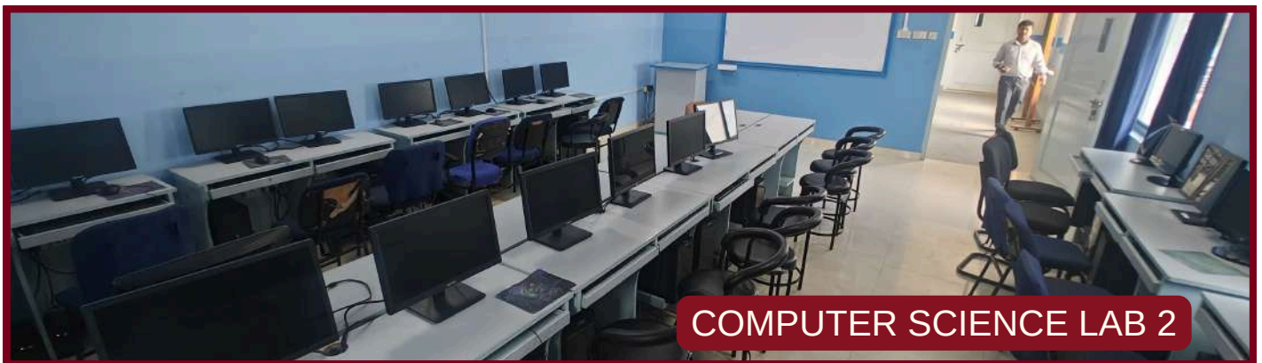
COMPUTER SCIENCE LAB 2