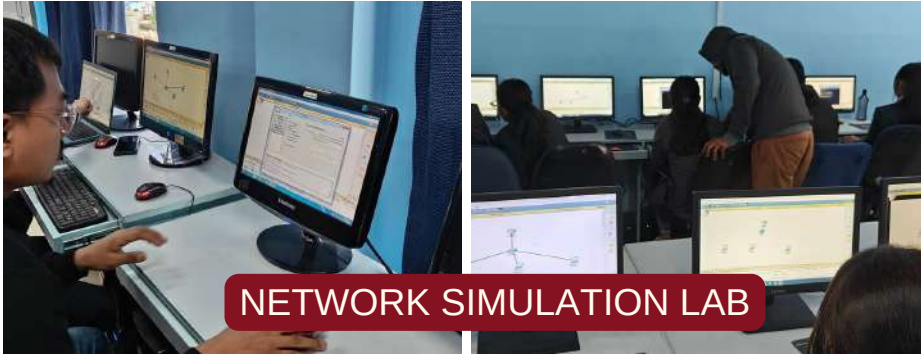
NETWORK SIMULATION LAB