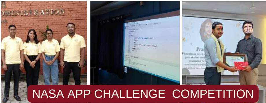
NASA APP CHALLENGE COMPETITION