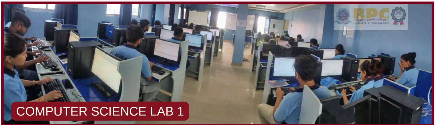
COMPUTER SCIENCE LAB 1