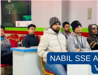
NABIL SSE AND INDUSTRIAL VISIT