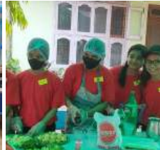
SEMIANARS AND FOOD FEST