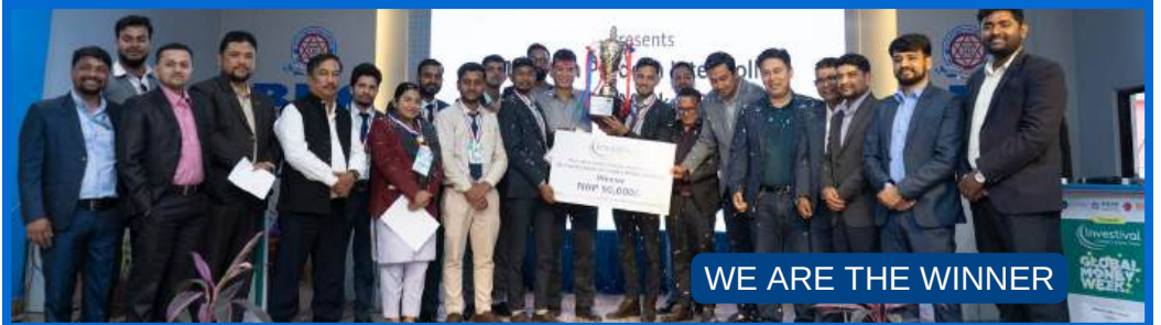
WE ARE THE WINNER