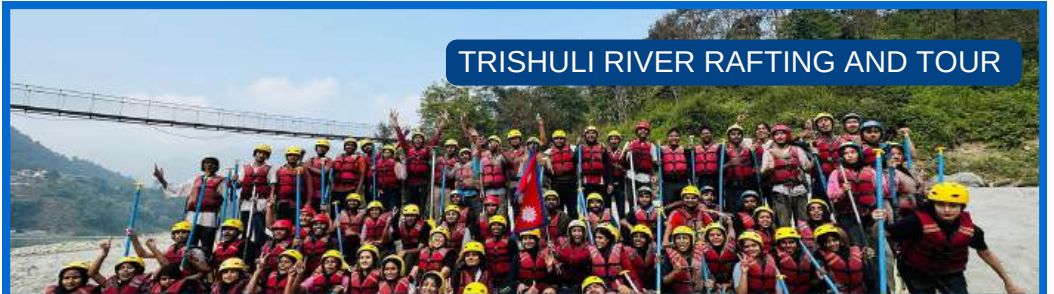
TRISHULI RIVER RAFTING AND TOUR